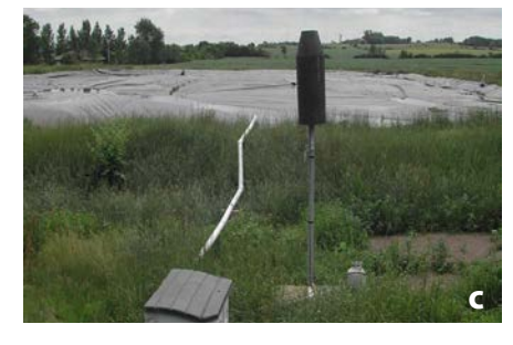
Figure 1. Types of anaerobic digesters: a) plug-flow b) complete mixed, and c) covered lagoon